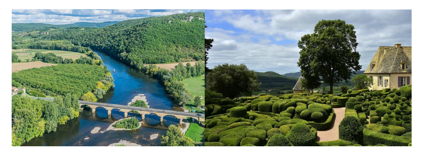
The Dordogne River valley

<u>Day 9 - Friday, October 21</u>: Today we tour the very scenic Dordogne River valley, with the mighty medieval castle of Beynac, pretty villages such as Domme, and the gardens of the <u>Château of Marqueyssac</u>, with their amazing topiaries.