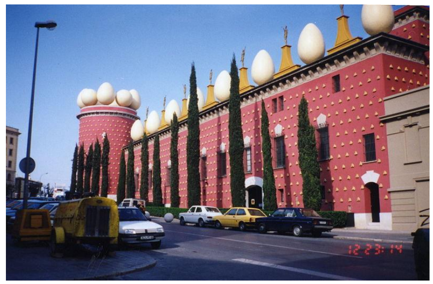
The Dali Theatre-Museum in Figueres

<u>Day 15 - Thursday, October 27</u>: Day at leisure in the beautiful resort of Rosas. Final group <u>dinner</u> in the restaurant of our hotel.