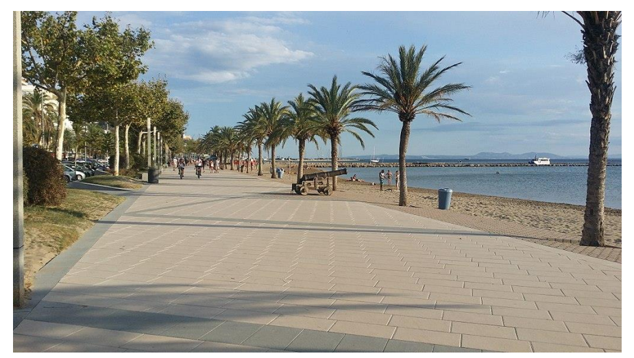
The waterfront in the resort of Rosas

continuation across the French border, the less known but equally impressive Côte Vermeille, or "Ruby Coast," both dotted with resorts such as Cadaques and Argelès, favourite haunts of painters such as Dali, Picasso, and Matisse. In the afternoon, we return to Roses via the Catalan town of Figueres, birthplace of Salvador Dali, where we visit the fascinating "Theatre-Museum" devoted to the life and work of the great surrealist artist. Return to the hotel and free evening.